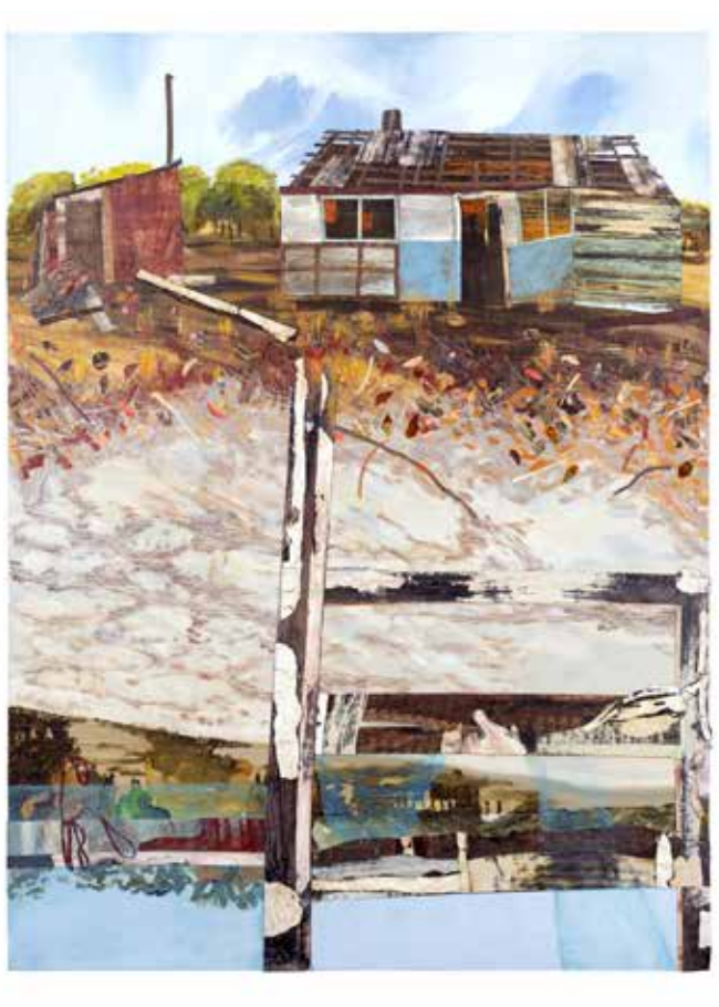
2024 Finalist Stuart Earnshaw Cult of forgetfulness 2023 oil, paper collage, coloured pencil on board (diptych)